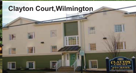
Clayton Court, Wilmington