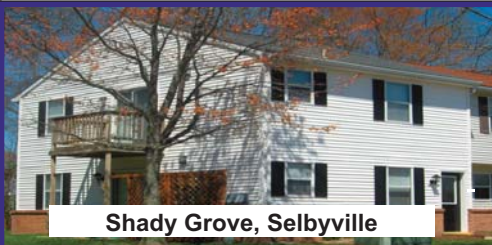
Shady Grove, Selbyville