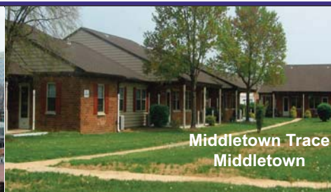
Middletown Trace Middletown