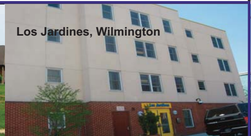
Los Jardines, Wilmington