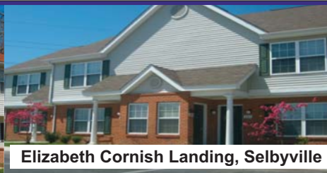
Elizabeth Cornish Landing, Selbyville