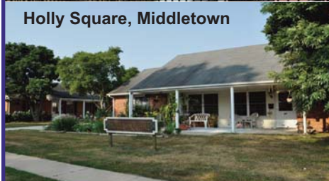
Holly Square, Middletown