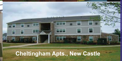
Cheltingham Apts., New Castle