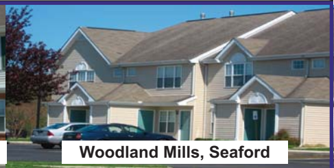
Woodland Mills, Seaford